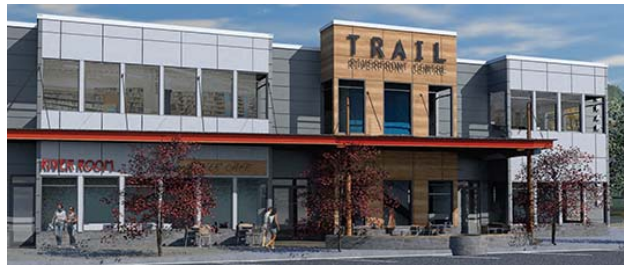
Rendering of proposed Riverfront Centre, at the corner of Bay Avenue and Helena Street.

A committee of our President, the Library Board chair and the City's Communications and Events Coordinator has been formed to oversee this work. Council approved a budget to cover the expenses that will be incurred. The Society has applied to the Kootenay Savings Foundation for a grant to assist with the media costs and the