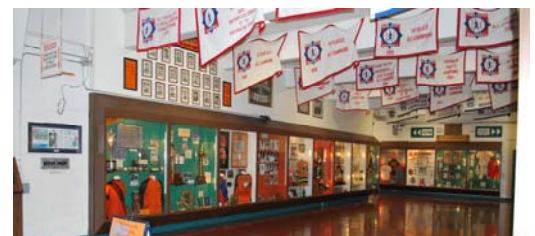
The Sports Hall of Memories, proudly exhibiting our community sporting heritage in the Trail Memorial Centre.

We would be remiss if we did not exercise due diligence to protect these important exhibits.