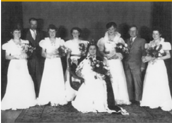
Miss Trail Royalty, 1934