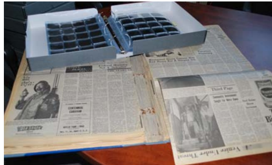
A binder containing Trail Times negatives from 1971, along with a book of 1971 original newspapers.

The project has provided our archives room with considerably more space in our for our growing collection.